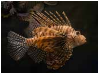
Janice Phillips Beautiful but Venomous