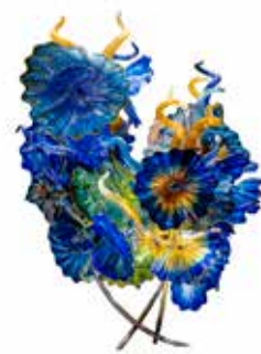
Clayton Fox Colorful Glass