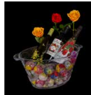
Paul Bessette Wine with Floral Accents