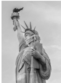
Clayton Fox Covid in Las Vegas