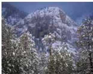
Serena Scalzi Mount Charleston