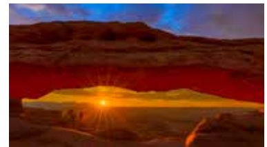
Doreen Lawrence The Golden Moment