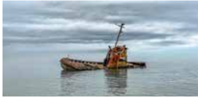
Allan Duff Ship Wreck