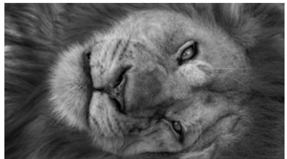
Doreen Lawrence Contours of Strength