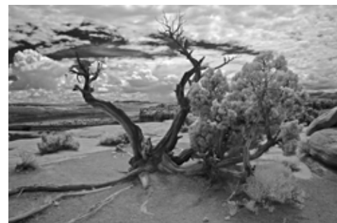
Craig Hicks Utah Wilderness