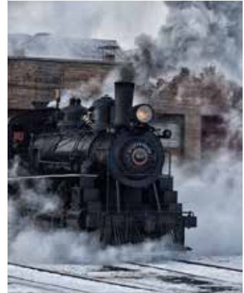
Juliana Stratton Safety First No. 40