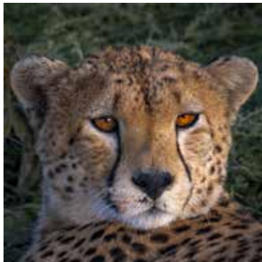
Cheetah Close-up