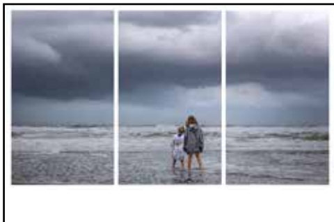
Terri Hutchings A Gray Day