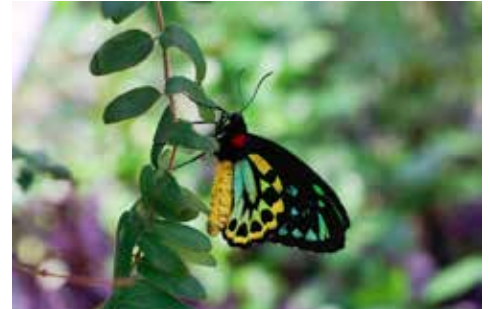
Julia Mejorada Green Birdwing