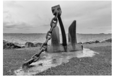
Linda Hicks Shipwreck Memorial