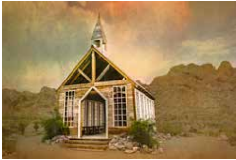
Terri Hutchings Church in the Desert