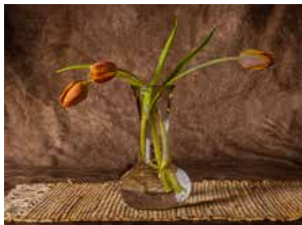
Paul Bessette Untitled