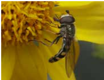
Hover Fly