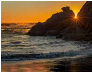
Ken Lawrence Coastal Smoky Sunset