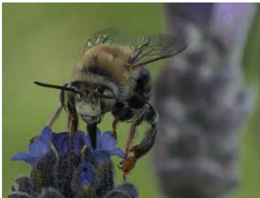
Digger Bee on Lavender