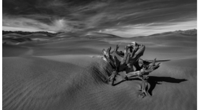
Doreen Lawrence A Twisted Tale