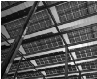
Serena Scalzi Solar Ceiling