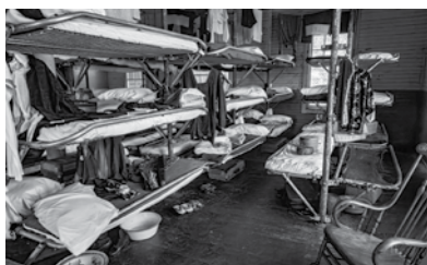
Ian Cheah Chinese Detention Center Angel Island