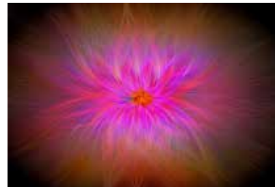
Narcy Alprecht Twirl of Pink