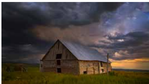
Doreen Lawrence Weathered