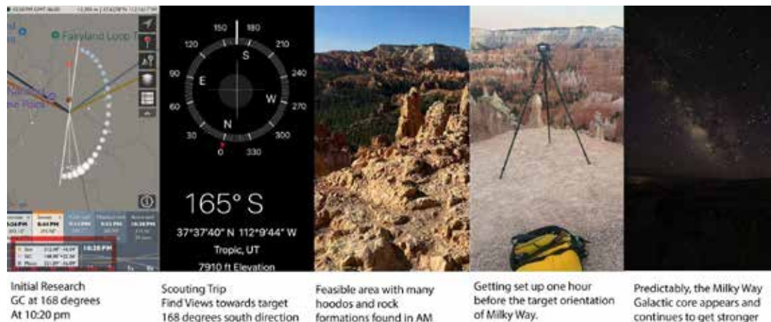
Initial Research GC at 168 degrees At 10:20 pm

Scouting during the daytime requires data from the apps. Most apps let you simulate when the Milky Way becomes visible at a location and provide precise geographic coordinates. In the example below, you can see at what time and direction the Milky Way would be in the orientation of interest to you. Assuming the Milky Way is visible at 10:20 pm, it would be located at 165 degrees from your current position. When you are at the location during the day, walk around with your phone's compass on. You can see what the foreground would be. If you don't like that, adjust your position until you line up your desired foreground. Take a picture with the phone and mark the spot to return to.