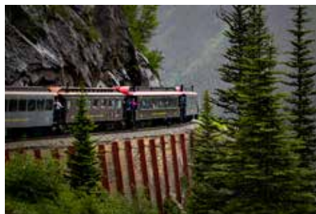
Terri Hutchings Coming Around the Mountain