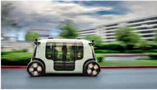
Clayton Fox Future Transport