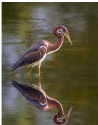
Ken Lawrence Tri-colored Heron Reflection