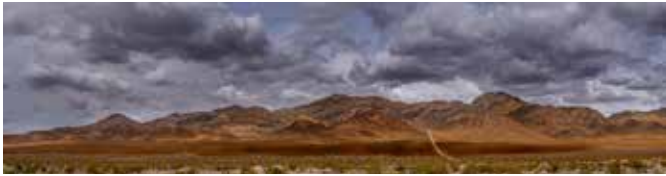
Panorama Bare Mountains, Nevada