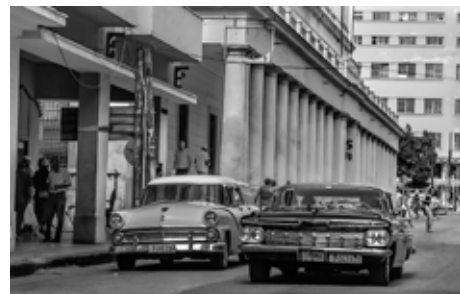
Hugo Pech Havana, Where Time Stands Still