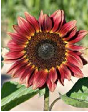
Phil Cenicola In the Eyes of the Beholder