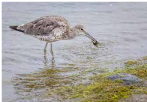
Anita Rama A Willet Washes a Crab Before Eating