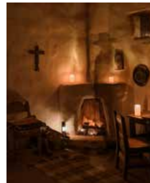
Doreen Lawrence Shadow from the Past