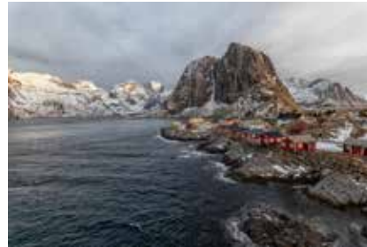
Linda Hicks Norwegian Fishing Village