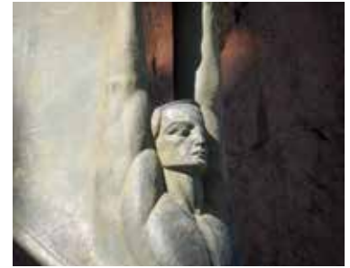
Serena Scalzi Hoover Dam