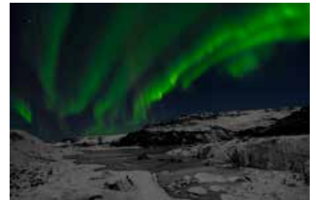
Leslie Gertie Iceland Aurora