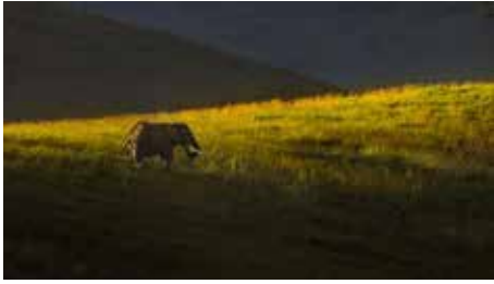
Doreen Lawrence Golden Embrace