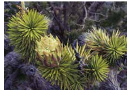
Craig Hicks Desert Bloom