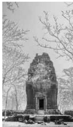
Gina Geldbach-Hall Koh Ker Temple