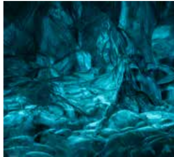
Leslie Gertie Sapphire Ice