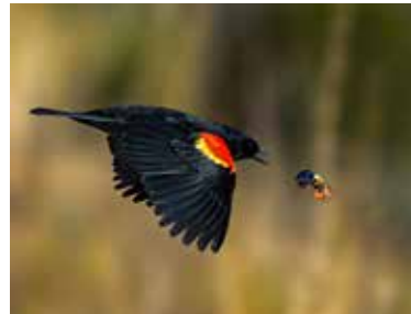
Ken Lawrence Fast Food