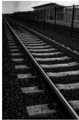
Jim Ryan Heading Nowhere