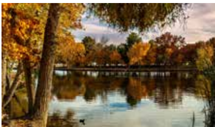
Jim Ludwick Fall - Floyd Lamb Park