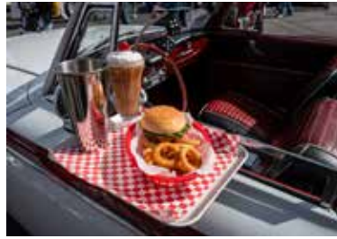
Jim Ludwick Drive-In Fast Food