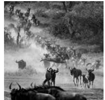
Doreen Lawrence Epic Journey