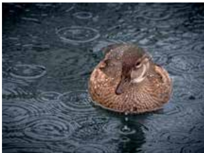
Terri Hutchings Untitled