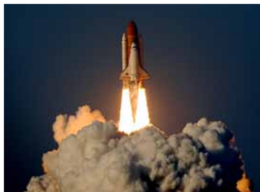
The Last Launch