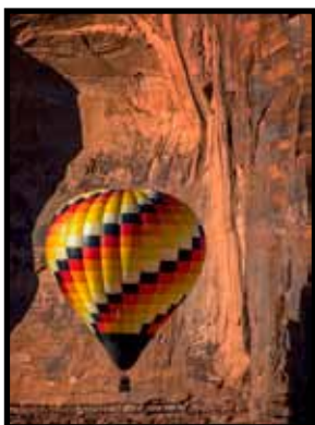
Hal du Pont Descending into the Valley