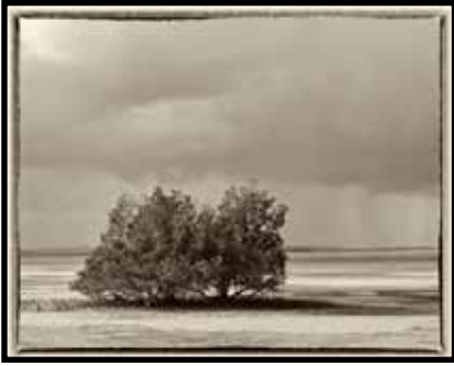
Harriet Smith Isolated

All photos © 2013 by named artists. All rights reserved.