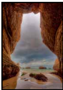
Allan Duff Devil's Doorway