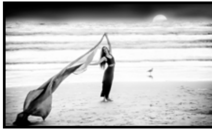
Gary Potts Beach Dreams