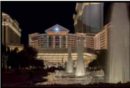
Abigail Buckler Caesar's Palace