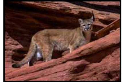
Hal du Pont Sleek