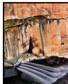
Craig Hicks Lowering Lake Powell